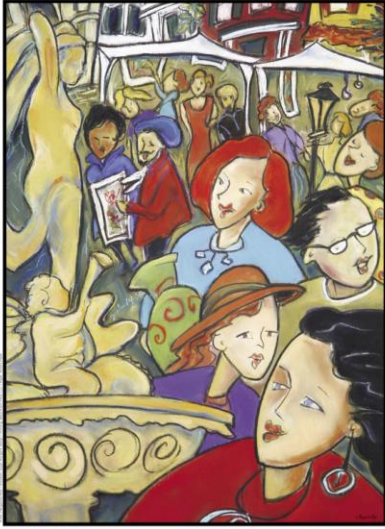
2007 Saint James Court 51ST ANNUAL ART SHOW

• Instructions for delivery of entries - Please read carefully this has changed from previous years.